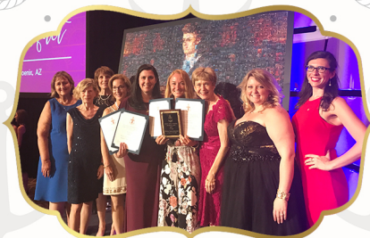
Awards Banquet at the 2018 Convention in Phoenix, AZ